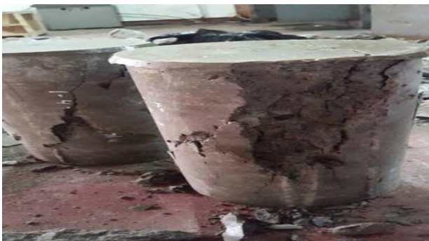
Fig. 3 Crack pattern of concrete cylinder test.

In the beginning, there is an uneven surface in some cylindrical concrete specimens. This is due to the shrinkage that occurs in the concrete during the binding process. So the surface decreases from its original state. Therefore, to get maximum results on the test specimen, before testing the specimen, it must be stamped to get a flat surface. Concrete B specimens which were 28 days old got 105.4% so that the specimens were included in the Indonesian concrete standardization. Besides concrete A and F, 28 days old are also included in the Indonesian concrete standard with values of 104.2% and 101.9% each.