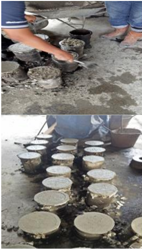
Fig. 1 Concrete sample testing.